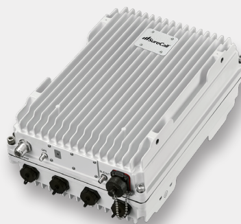
Master Unit SC-FiberMU-CA

SignalMax boosts AWS-3 frequency bands for 15% more 5G spectrum than traditional 5-band boosters. It delivers best-in-class RF coverage and connectivity for all Canadian carriers, including Bell, Telus, and Rogers.