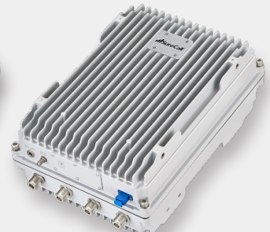
Remote Unit SC-FiberRU-CA